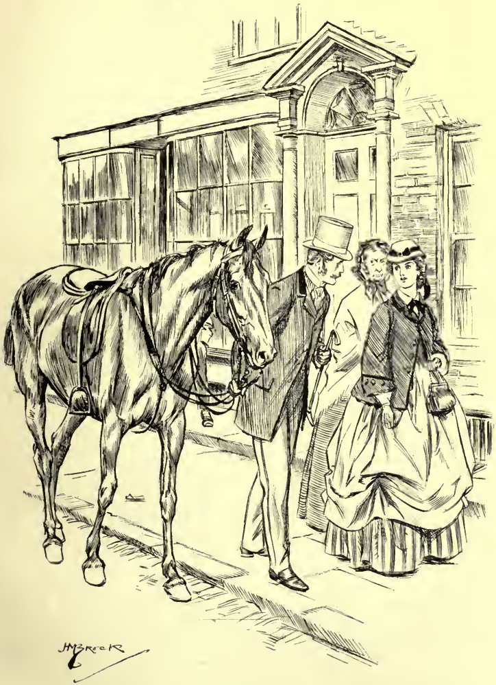
"He accompanied Miss Jones along the footway."